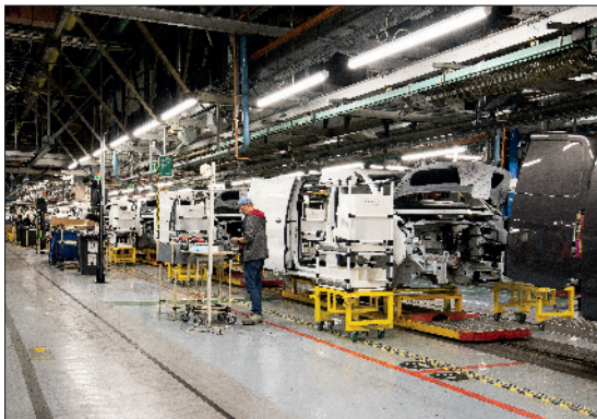
Vauxhall Assembly Plant, Luton. BELL Ultra Batters