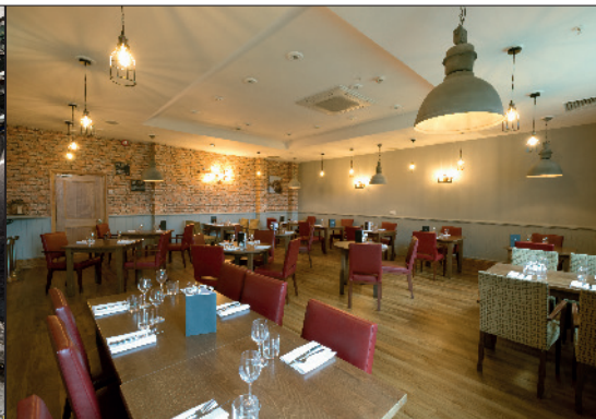
Country House Hotel, Saint-Benoit France BELL LED Retro Vintage Pendant Lamps