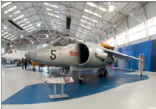
RAF Museum Cosford BELL Illumina 150W High Bay Fittings