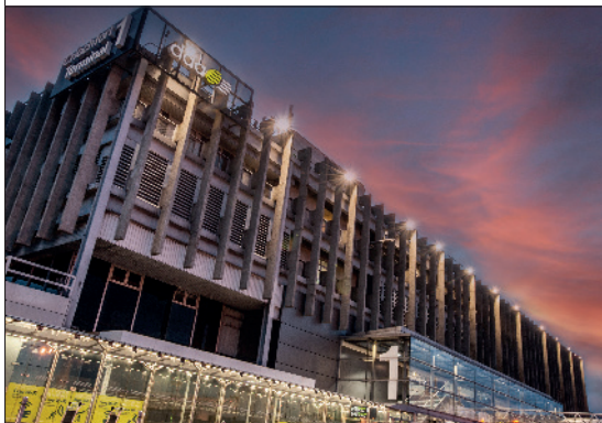
Dublin Airport, Republic of Ireland BELL 200W Skyline Pro Floodlights